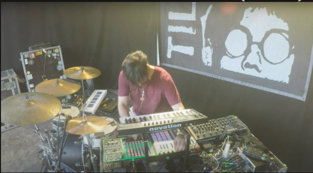
live at 'Tilos Maraton' (2022)