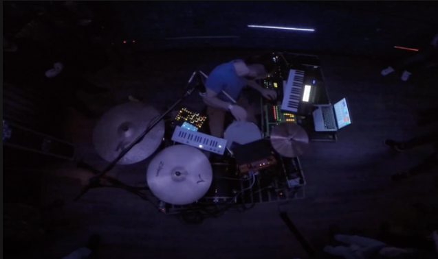
live at 'Edith' (2024)