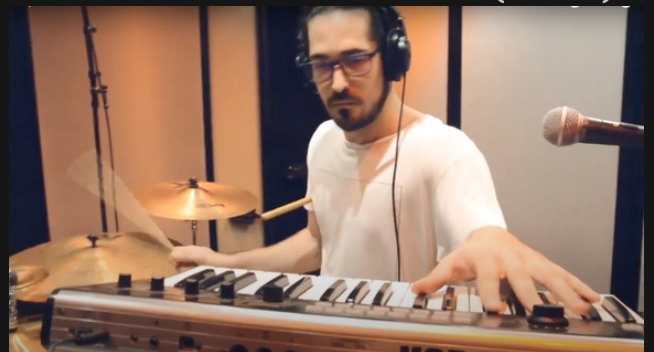
live at 'Noize Fabrik' (2018)