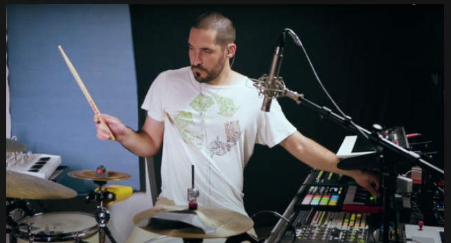
live at 'A Terem' (2021)