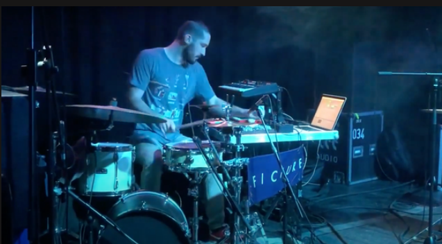
live at 'Dürer kert' (2020)