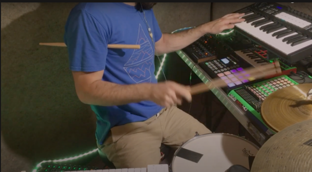
2022 live act